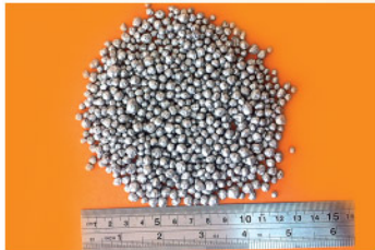
ALUMINIUM GRANULE (TAJ-ALG)