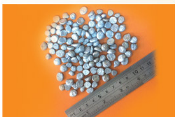
ALUMINIUM SHOTS (TAJ-ALS)